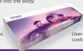
User-friendly customer box.